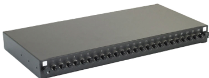
B. Panels are available part or fully loaded