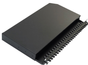
A. Sliding drawer design

The Excel range of ST patch panels are sliding drawer 'tray style' housings suitable for either direct termination or splicing of upto 24 fibres in 1U of rack space. Each panel is manufactured from high quality 2mm thick steel and finished in Black powder coated paint to provide a strong and durable unit. To the front of the patch panel the specified number of simplex adaptors are loaded from left to right. The fascia also houses the release latches for the sliding drawer. Each adaptor is fitted with a colour coded dust cap, Black for multimode, Red for singlemode. Each simplex adaptor accommodates one terminated fibre. Each panel has included within it a set of adjustable fixing arms, and a cable management pack which includes cable entry glands, cable ties, and a 24 way splice bridge.