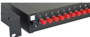
C. Adjustable fixing arms, clear port and panel labelling